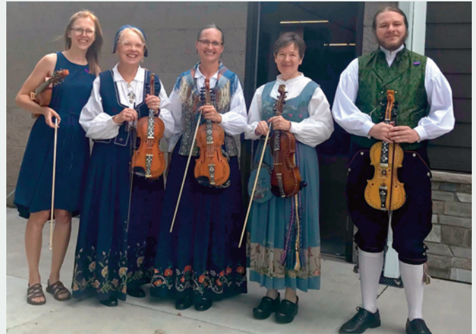
Twin Cities Hardanger Fiddlers