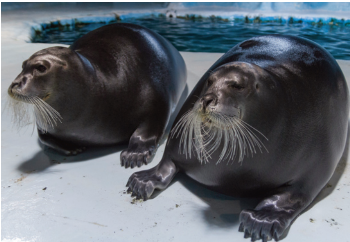
Making new friends at the Polaria Museum

In the northernmost part of Norway tucked near the water's edge in Tromsø you will find an attraction called "Polaria."